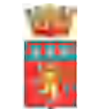
Comune di Massa Marittima